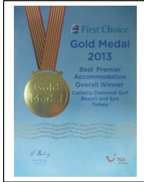
FIRST CHOICE – GOLD CHOICE