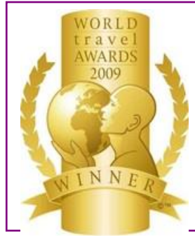
WTA – Turkey's Leading Spa Resort