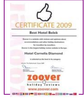
ZOOVER – BEST HOTEL BELEK