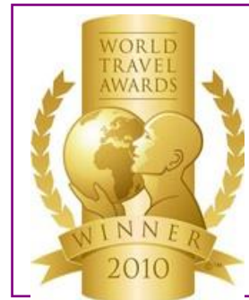
WTA – World's Leading All Inclusive Golf Resort