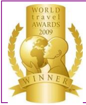
WTA – Europe's Leading Golf Resort