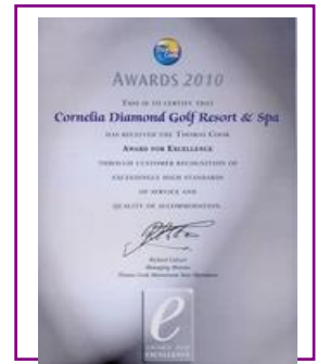
MARK for EXCELLENCE