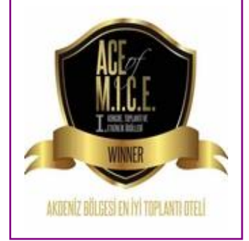
ACE of MICE – Best Congress Hotel in Antalya