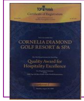
TOPHOTELS – AWARD for EXCELLENCE