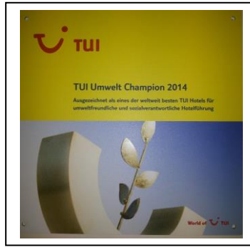
TUI – UMWELT CHAMPION