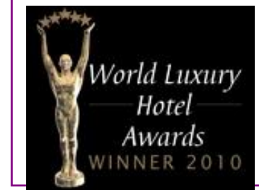
WORLD LUXURY – BEST LUXURY GOLF RESORT