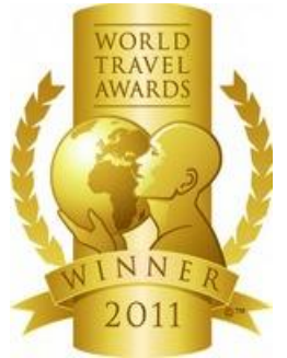
WTA – Europe's Leading Resort Villa