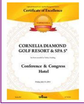
TOPHOTELS – Turkey's Leading Conference