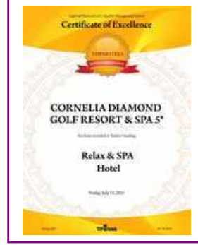
TOPHOTELS – Turkey's Leading Relax & SPA