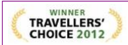
TRIPADVISOR – Top 25 All Inclusive Resorts in Europe