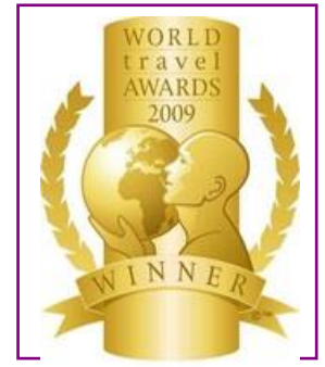
WTA – Europe's Leading Spa Resort