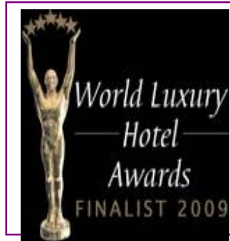
WORLD LUXURY – LUXURY GOLF RESORT