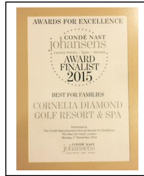
CONDE NAST JOHANSENS