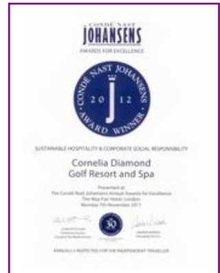
CONDE NAST JOHANSENS – WINNER (Sustainable Hospitality and Corporate Social Responsibility 2012)