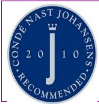
CONDE NAST – RECOMMENDED HOTEL