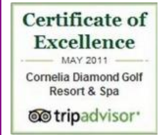
TRIP ADVISOR – CERTIFICATE of EXCELLENCE