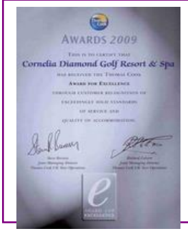
AWARD for EXCELLENCE