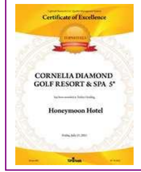
TOPHOTELS – Turkey's Leading Honeymoon