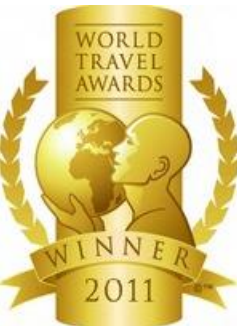
WTA – Europe's Leading Luxury Resort