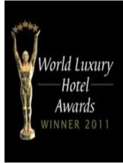
WORLD LUXURY – BEST LUXURY SPA RESORT