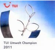
TUI – UMWELT CHAMPION