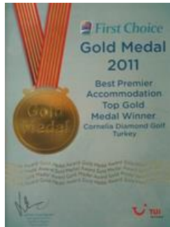
FIRST CHOICE – GOLD MEDAL