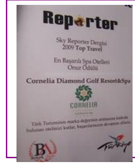
REPORTER MAG. – BEST SPA HOTEL