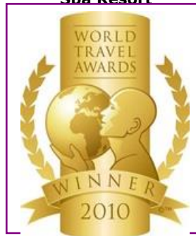
WTA – Europe's Leading Spa Resort