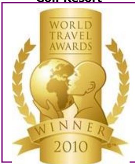
WTA – Europe's Leading Luxury Resort