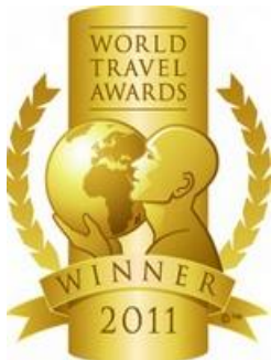
WTA – World's Leading Fully Integrated Resort