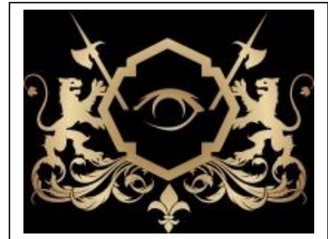
EYE AWARD – EUROPE'S BEST SPORT HOTEL