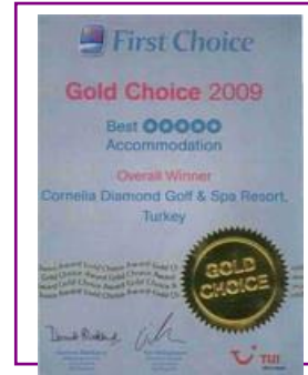
FIRST CHOICE – GOLD CHOICE